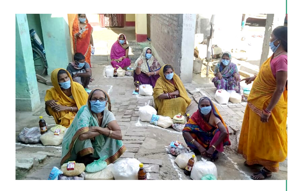
A Report by Nirantar Trust